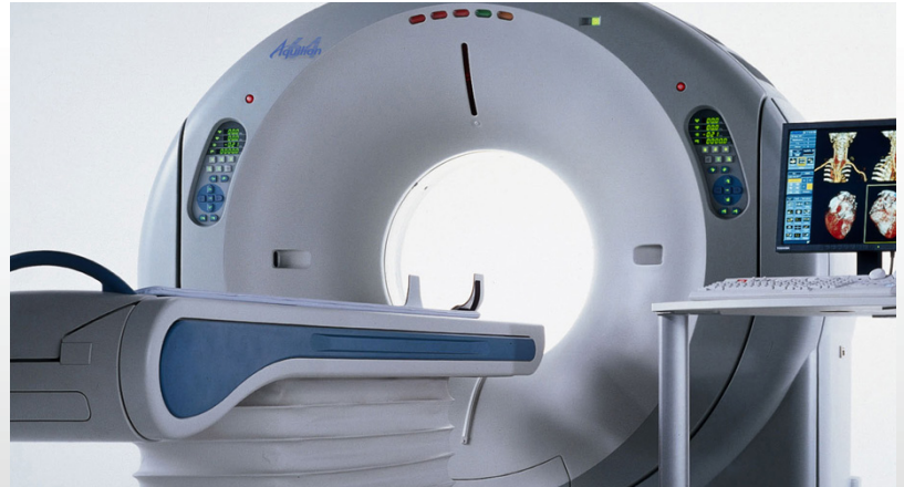
Toshiba's Aquilion 64 CT System

“ We need a cost effective way to upgrade our CT technology ”